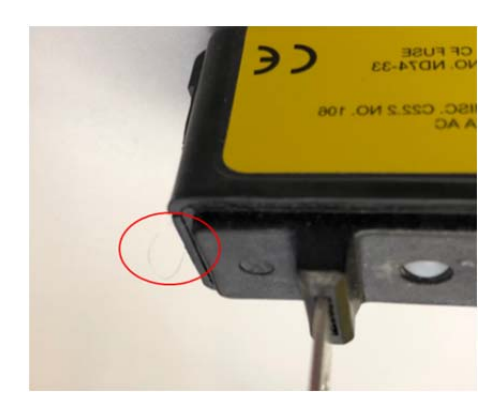
Step 2a. If a wire is present, return the unit to your authorized Bussmann source to receive a no-cost replacement unit.

Step 2b. If no wire is detected, proceed to step 3 for cover installation procedures.